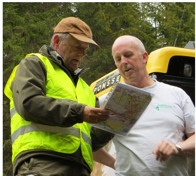
Consultant and operator of a processor discuss a harvesting plan.